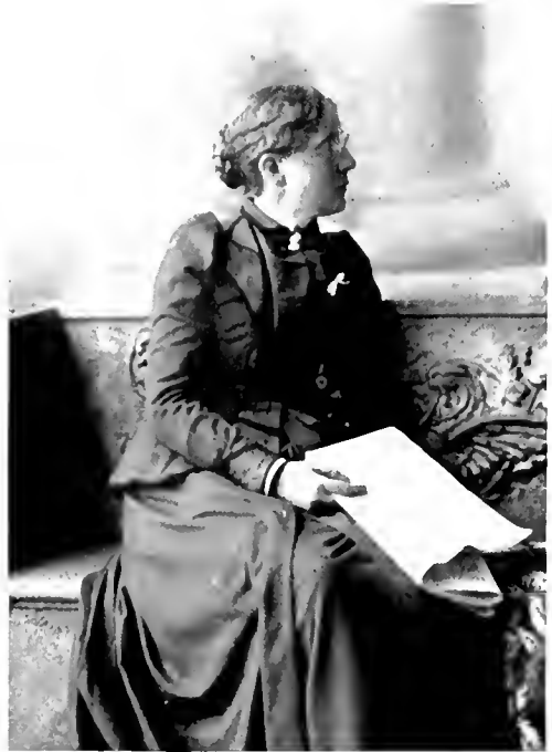
FRANCES ELIZABETH WILLARD.

of which she was dean and professor of æsthetics in the University. Her success as a teacher was very marked. In coeducation she was ever an earnest believer, and she dealt with the unsolved problems of coeducation in its early stages with cheer, hopefulness and skill. As president of the Ladies' College, Evanston, she was free to work her will, as she says, "as an older sister of girls," and there was instituted her system of self-government, which bore excellent fruit and has been followed in other institutions with success. The Roll of Honor Club, open to all pupils, had for its general principles "to cooperate with the faculty in securing good order and lady-like behavior among the boarding pupils, both in study and recreation hours, in inspiring a high sense of honor, personal responsibility and self-respect." Pupils were not regarded as on the roll of honor after they had transgressed a single regulation of the club, and their places were supplied by those whose lives were